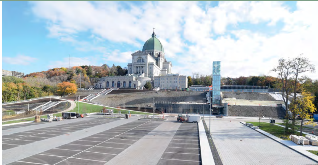
The major development project has often been presented in sketches and plans. This time, a photo taken on November 4, 2023 gives a glimpse of the redeveloped site. What was once a project is now a reality!

All over the site, specialized workers are busy with their tasks: building formwork and steel reinforcements;