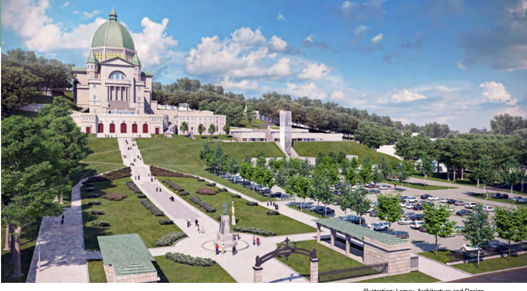
Illustration: Lemay, Architecture and Design

The future pavilion will be heated with geothermal energy , essentially drawing heat from the ground. Very deep wells were drilled and, thanks to a closed loop glycol system, heat from