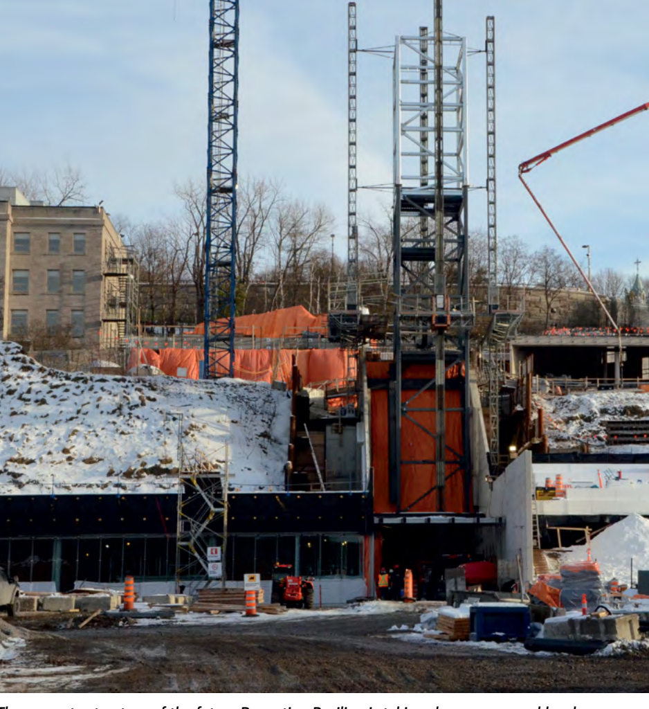
The concrete structure of the future Reception Pavilion is taking shape on several levels to the west of the Sainte-Croix Pavilion. In the center, a steel structure will receive the bells of the restored carillon. – Photo. November 2022: André Charron

During the winter months, workers were busy inside the building setting up the infrastructure for the reception and food services as well as the Gift Shop. In addition, the construction of the long corridor that will link the pavilion and the shrine is well underway.